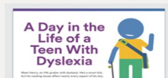
A Day in the Life of a Teen With Dyslexia