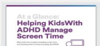
At a Glance: Helping Kids With ADHD Manage Screen Time