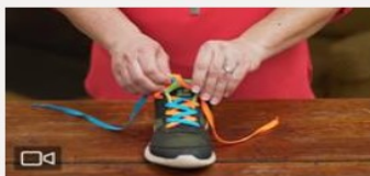
2-Minute Tutorial: How to Teach Your Child to Tie Shoes