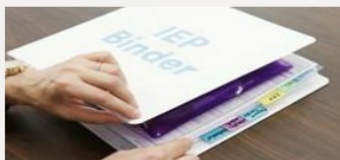
How to Organize Your Child's IEP Binder