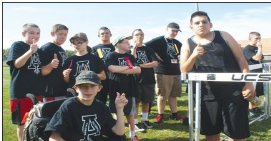
Members of Almont's Special Olympics team give thumbs-up to the big event.